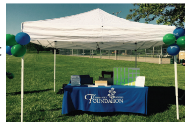
The Elkhorn Alumni Program participated in the 2016 Elkhorn Day Celebration.

and encourage your fellow classmates to do the same. Our first official event will be a tailgate party on October 7th, prior to the EHS/ESHS football game. To stay connected, follow us on our Facebook or Twitter pages.