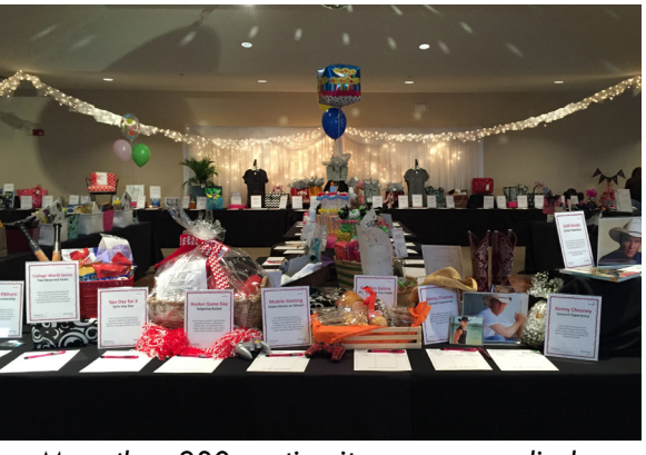
More than 230 auction items were on display