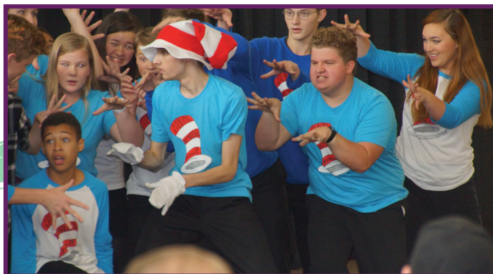
Elkhorn High School Musical Cast members of Seussical the Musical give a sneak peek of their November production.