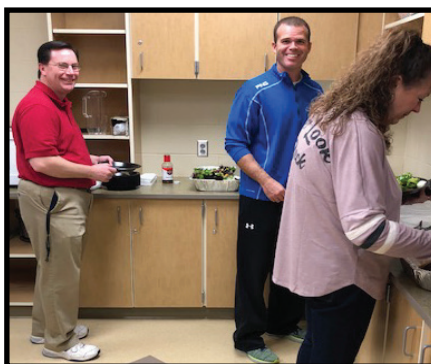
Elkhorn Grandview Middle School staff members enjoy their Sam & Louie's catered lunch.