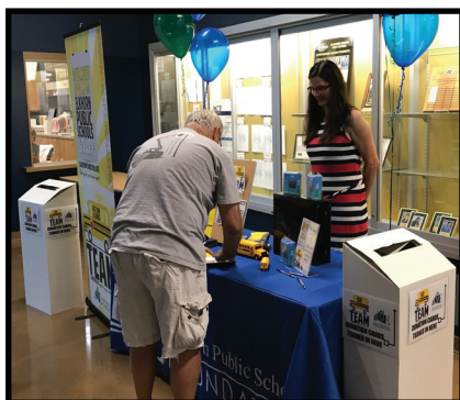
The Foundation table ready to take T.E.A.M. Donation cards on August 14th at the EPS Staff Opening Ceremonies.

All T.E.A.M. Campaign donors could participate in a jeans day on September 7th, and also received a small gift from the Foundation. Any staff member that donated $50 or more received a bonus gift. New this year, a donation of $75+ got entered into a drawing for a gift certificate to The Locked Room Omaha for an evening of fun and escape. Each year schools compete to have the highest average donation per staff member to win quarterly food and snack treats from the Foundation. The Elkhorn Public Schools staff truly put together a T.E.A.M. effort raising a record breaking total of $43,000 in donations from 672 donors! Congratulations to Elkhorn High School, Elkhorn Grandview Middle School and Westridge Elementary School, who won treats to be provided by the Foundation. Thank you EPS Staff for 'Getting on the Bus' with the Foundation! We are truly humbled by your kindness and could not be prouder of your compassion and commitment to your students!