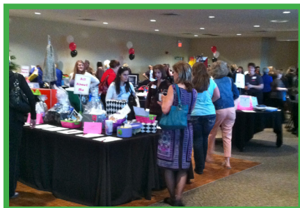
Women from the community browsing the silent auction and raffle items at Bids 4 Kids.

More than $15,000 was raised to help support Foundation programs such as classroom grants, scholarships, robotics, author visits, reading intervention programs and more which impact all 6,000+ students within the Elkhorn Public Schools District.