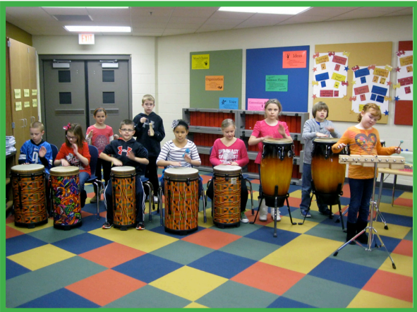
Students at West Dodge Station enjoying a classroom grant for music.

Technology enhancements, family reading programs, robotics, science equipment and dissection