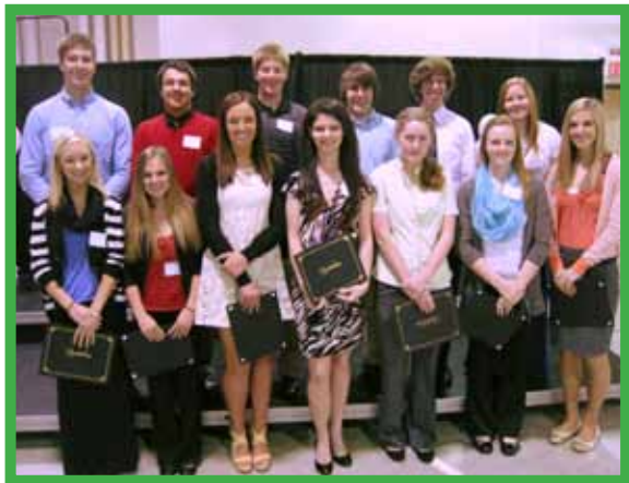
2013 Elkhorn High School Seniors who received the Elkhorn Public Schools Foundation Scholarship.

In 2013, the Elkhorn Public Schools Foundation awarded 98 scholarships totaling over $160,000 to Elkhorn High School and Elkhorn South High School graduating seniors.