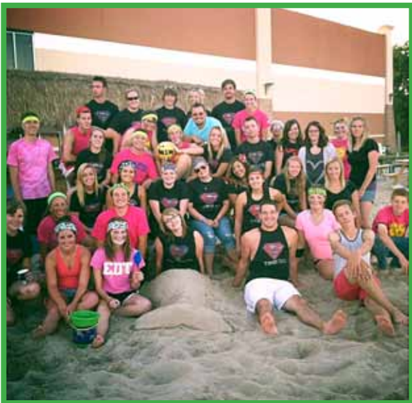
Elkhorn Kids Campus Staff at their 2013 Summer Volleyball Party.